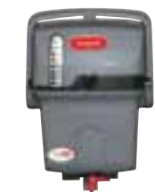
TrueSTEAM™ Humidification System

Three-Wire Communication Only three wires from the thermostat to the Equipment Interface Module make even retrofit installations quick and easy.