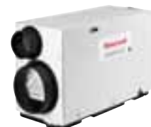
TrueDRY™ DR90 Whole-House Dehumidifier

Controls Humidification Terminals allow you to wire and control bypass, flow-through or steam humidifiers.