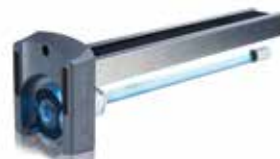
UV Air Purification and Odor Absorption