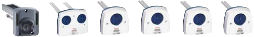
Model UV2400U5000 UV100E2009 UV100E3007 UV100E1043 UV100A1059 UV100A2008